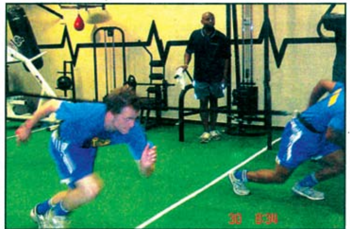
Two players from the US Parma premier soccer team work on overspend acceleration at the East Coast Conditioning facility in Clark.

Summer sessions in Clark are forming now. For more information on the upcoming sessions and East Coast Conditioning call 732-381-9376 or visit www.eastcoastconditioning.com .